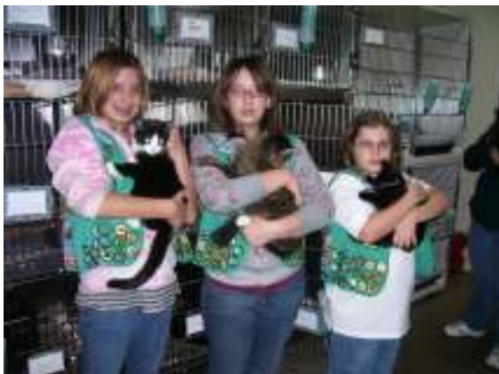
The girls are sitting on the blankets and towels that they collected (top) and spending time with the cats was a lot of fun for them (bottom).